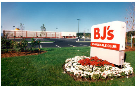
Framingham, MA – Retail 25 Newbury Street

5,000 SF Retail – Office Redevelopment Development Advisor – Manager Client – Family Partnership