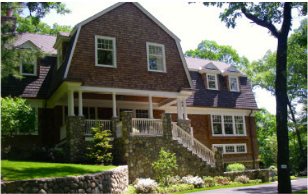
Winchester, MA 50 Lorena Road

Single Family - Redevelopment Owner - Developer