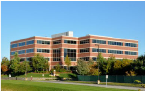
Burlington, MA – Office 4 Van de Graaff Drive

93,000 SF – New Construction First Class Office Owner – Developer