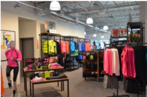
Wellesley, MA – Retail 475 Washington Street

93,000 SF – New Construction First Class Office Owner – Developer