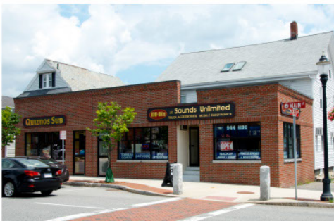
Reading, MA – Mixed Use 505 Main Street

10,000 SF – Redevelopment Development Advisor – Manager Client – Family Trust