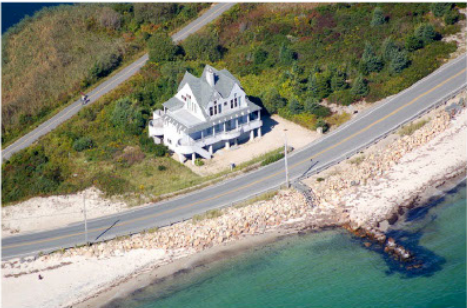
Falmouth, MA - Residential 617 Surf Drive

Single Family - Redevelopment Owner - Developer