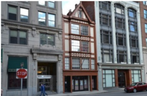
Boston, MA – Mixed Use 150 State Street

20,000 SF – Complete Rehab Development Advisor – Manager Client – Pension Fund & Advisor